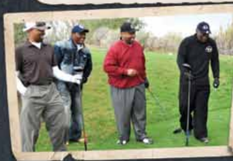
2010 Golf Fellowship