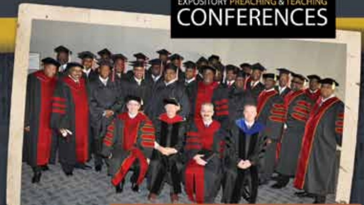
FAITH SEMINARY GRADUATES 2010