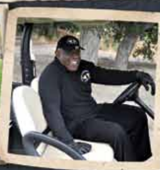
Dr. R.A. Williams 2010 Golf Fellowship